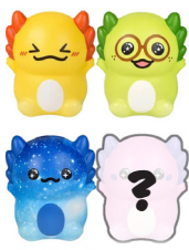
Mystery color squish axolotl